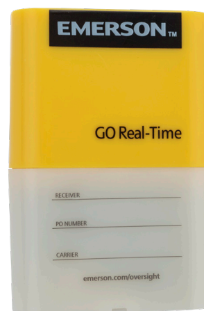
Emerson GO Real-Time Tracker unit

"It's important to us to preserve the freshness of each shipment," said Sanchez. "Now that we have the real-time visibility and can access reports to verify temperatures during each shipment, we're better equipped to optimize food quality and respond to customer disputes."